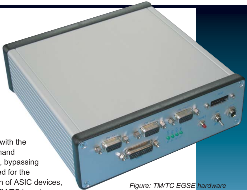
Figure: TM/TC EGSE hardware