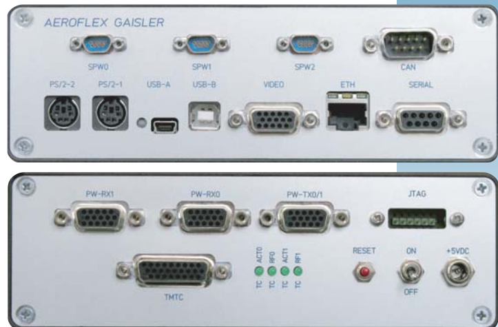
Figure: TM/TC EGSE hardware interfaces (front and back panels)