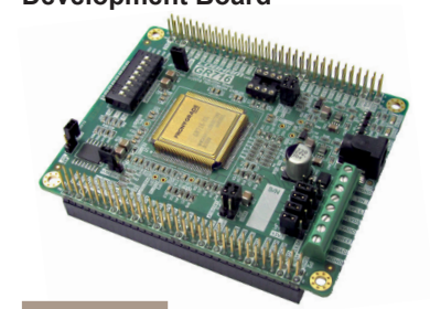
GR-CPCI-GR716-DEV-Mother Interface Board